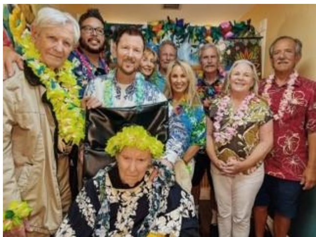
The Moore Family